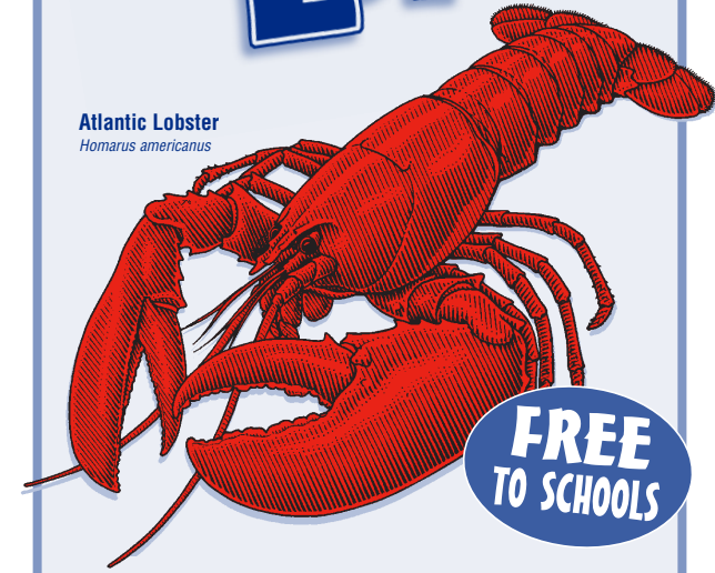
Atlantic Lobster Homarus americanus

Introducing a Fun and Informative Program About Lobsters Created Especially for Kids!